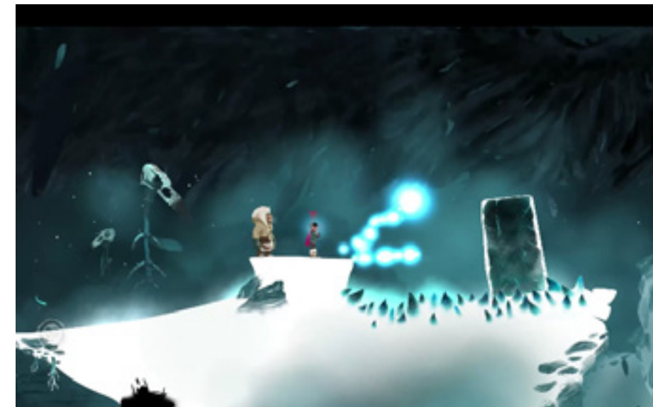
Last Inua videogame 2014 Link to steam

good cop / naughty cop make instant electronic compositions with self-programmed software and self-made controllers. They look for ways to accomplish a physical approach towards electronic music (and in particular realtime synthesis). They use bicycles, radios and sensors in their performances.