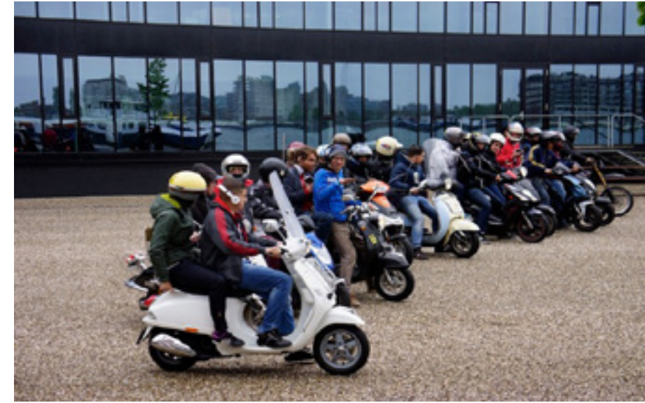
Dus Niet Brommen scooter radioplay 2013 Link to vimeo

For the Old Church in Amsterdam I composed the piece Removing the Entrance , inspired by The Entrance by Robert Ashley. The piece was performed with two sound bicycles, eight radios, a FM transmitter, Super-Collider and church organ.