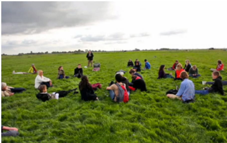
Fastforward radioplay 2014 Link to soundcloud

Teenagers drive the audience around the city on scooters, while they are listening together to a radioplay that is influenced by the vibrations of the scooters. The piece was commissioned by art organization Noordkaap and was performed during festival Urban Explorers.