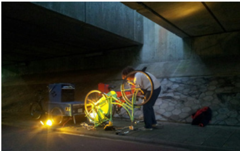
good cop / naughty cop electroacoustic band Link to website