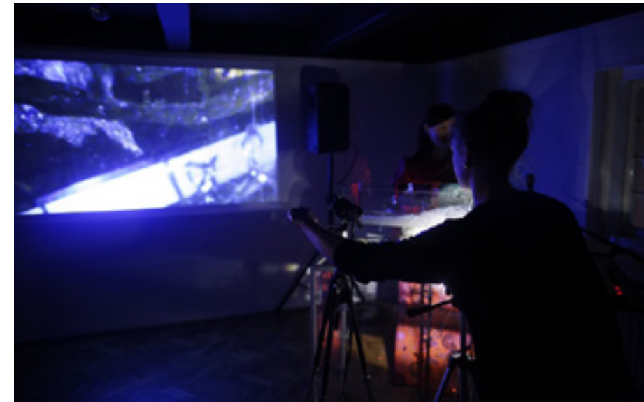
A way a lone a last a lost a loved a long the audiovisual narration 2016 Link to soundcloud